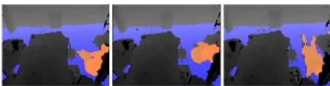
Figure 2. Hospital fall; blue area for ground and the orange object as foreground after using an adaptive background subtraction algorithm.

For the first level it was required to find a way to address frames inside each video, so that the user could easily understand which portion of video filled just by blank frames and which part contains movements or fall events. Having a meta-data file alongside each video file at the create time, eliminates any reprocessing on the video files which could be time consuming. As shown in Fig. 3 while processing the videos the fall detection algorithm [6] classifies each frame into three classes of “Blank”, “With Movement” and “With Fall Event” which we assigned colors “black”, “yellow” and “red”, respectively and the corresponding indicator for each of them is stored in the meta-data file. In the final visualization tool we will provide a value for each frame – timestamp – and present them in a specific color coding based on these class indicators so that the user is able to distinguish different frames at a glance.