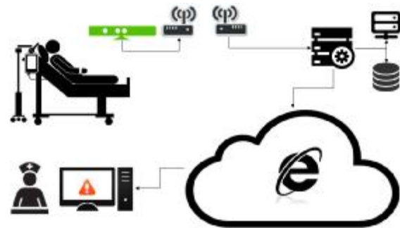
Figure 1. Fall Detection and depth video rewind data flow. Captured videos from Kinect cameras are transferred through Wi-Fi to the file server and a relevant record to the database. Nurses can review alarms and a whole relevant video series over the web application.

Our proposed web-based application provides a handy user interface to easily search among terabytes of depth videos to find the video sequences of interest. We then introduce a novel technique to visualize high level information about these depth frames containing movement or falls. This can allow the hospital staff to keep track of fall events in order to facilitate the process of finding and reviewing the chain of events that led up to the patient fall for post-fall quality improvement process.