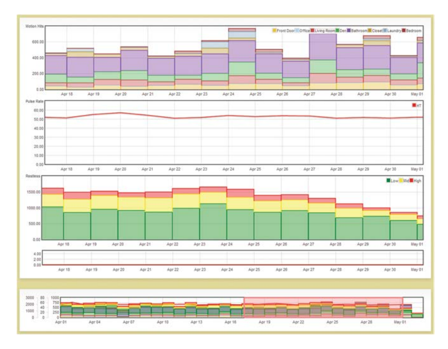
Fig. 2. View of sensor data on the improved Version 2 interface showing motion data (row 1) pulse rate (row 2), and bed restlessness (row 3). Notice the time range selection bar at the bottom (row 4). The highlighted date range is the range displayed in the large view.

In order to reduce frustration in time navigation and to enable the user to have better control over date ranges, a range selection tool is used in Version 2. Allowing a user to adjust and move a window easily without having to re-load the page is an efficient interaction [16, 17] because it reduces the time and thought put into changing the date range as was required for Version 1. The new date range selection bar is shown in Fig. 2.