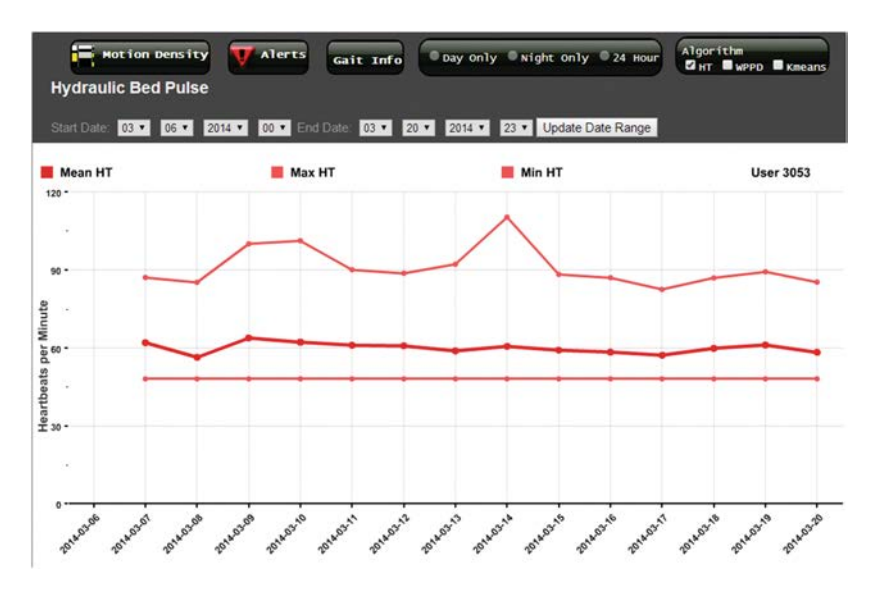
Fig. 1. Screen-shot of chart for viewing pulse captured from the hydraulic bed sensor. Note that the use of space seems cluttered, and that the navigation bar contains date ranges with multiple drop-downs. Many unrelated buttons are placed at the top of the page

Once users choose a resident, they are shown a web page of varying charts, each one showing a different measure, yet colors and styles of charts are displayed almost exactly the same, causing extra cognitive load on the user by having to inspect each title carefully to find the chart they are looking for [16]. The charts are labeled with the measure they are presenting; however, it is not prominent. For example, see Fig. 1. Users have reported that this is a problem.